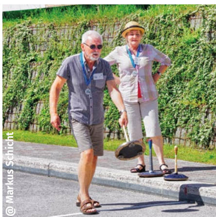
@ Markus Schicht